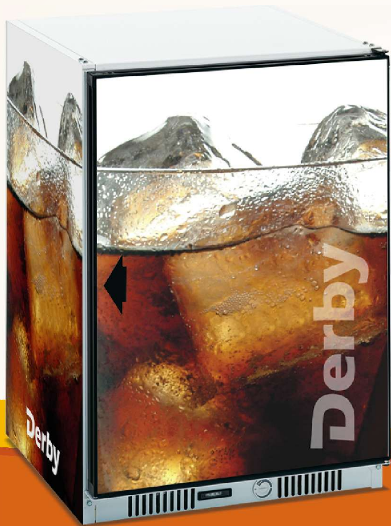
G 18C Beverages