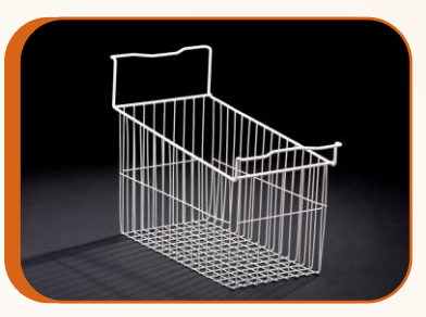
WIDE ASSORTMENT OF BASKETS