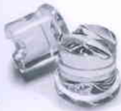
B 8040 AS / WS

Also available in the self-contained range for "Bistrot" cube: B 1706, B 2608, B 3515, B 4422, B 5522, B 7040, B 9050 See pertaining literature for more details