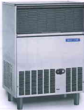
B 8040 AS/WS