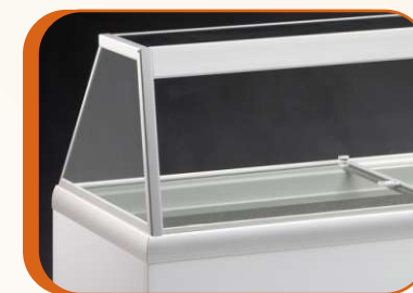
SERVE OVER GLASS COUNTER*