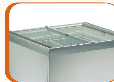
FLAT SLIDING GLASS LIDS