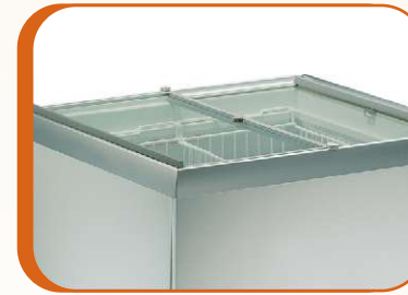
FLAT SLIDING GLASS LIDS