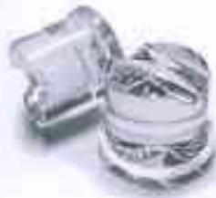
B 4422 AS / WS

Also available in the self-contained range for "Bistrot" cube: B 1706, B 2608, B 3515, B 5522, B 7040, B 8040, B 9050. See pertaining literature for more details.