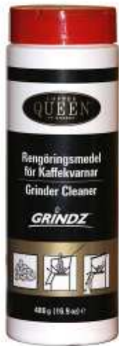
Cleansing agent for grinder.