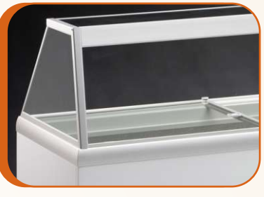
SERVE OVER GLASS COUNTER*