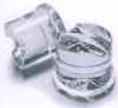
B 3515 AS / WS

Also available in the self-contained range for "Bistrot" cube: B 1706, B 2608, B 4422, B 5522, B 7040, B 8040, B 9050 See performing literature for more details