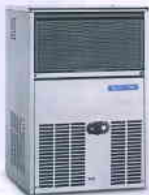
B 3515 AS/W5